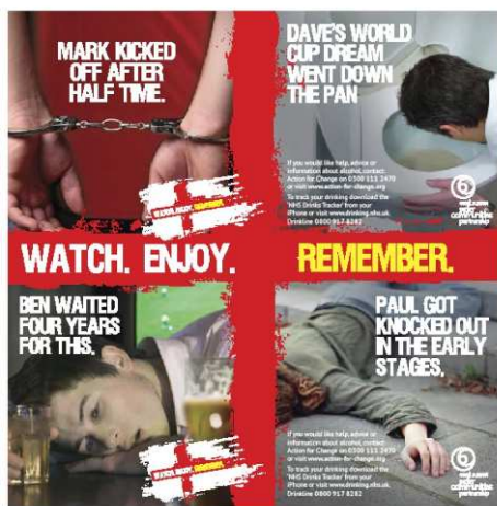
Above: 4x Beer mats