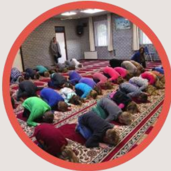
Picture posted online Jan 2016 ‘American students being “forced” to pray to Allah’.