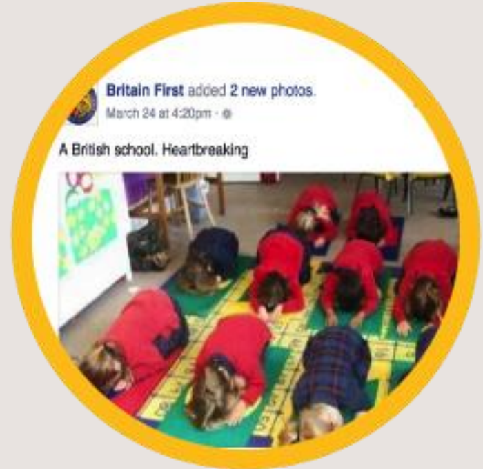
Picture posted online March 2016 by Britain First with the headline ‘Heartbreaking’.